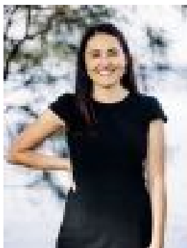
Property Management Lake Macquarie 0249596577