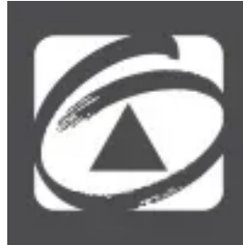
First National Clayton 0399757888