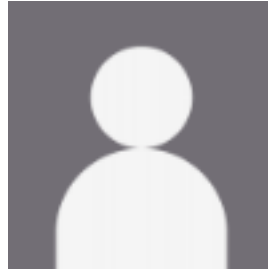
Prestige Property Group Property Management 0295977372