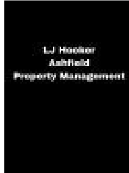
LJ Hooker Ashfield Property Management 0297976044