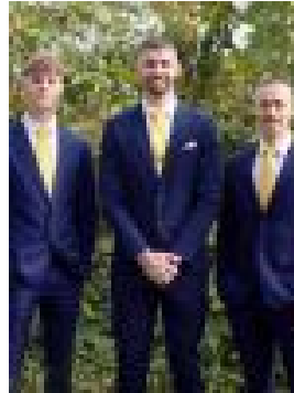
The Padjen Group 0422761463