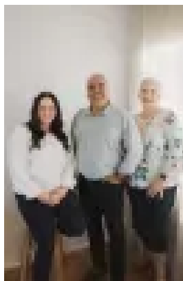
Seminara Co Rentals 0419604302