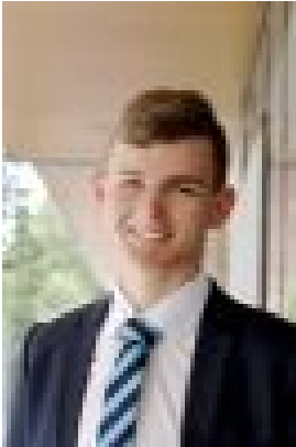
Fin JTS Realty 0472682532