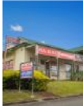
Sales Team 0733768000