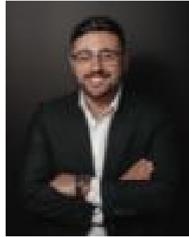
Cristian Malgioglio 0290710306