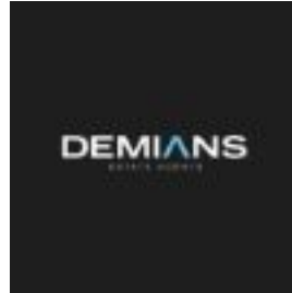
Demians Leasing 0294150938