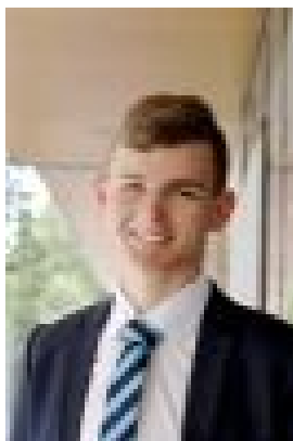
Fin JTS Realty 0265415331