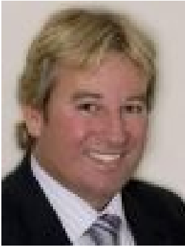
Glen Rose 0400017994