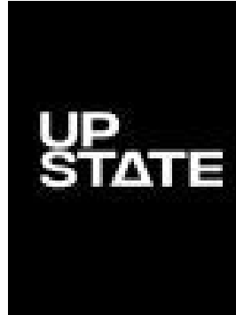
Leasing Team 0484005351