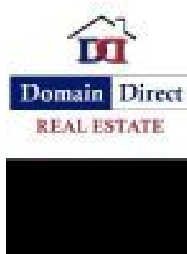
Domain Direct Real Estate