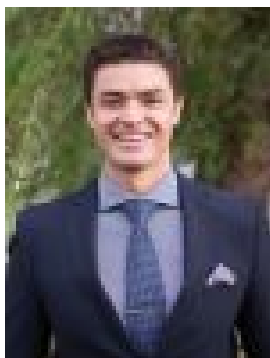
Chee-ky Dunlop 0387691888