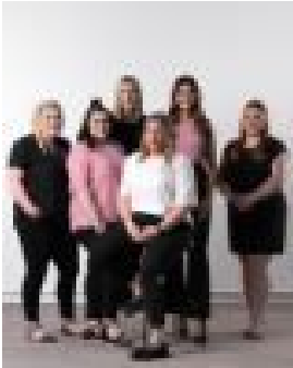
Property Management Team