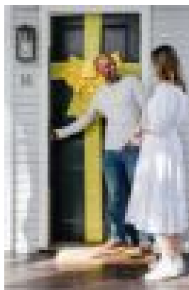
The Coco Team 0423284888