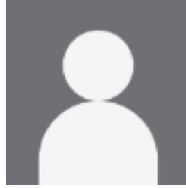
PRD Liverpool 02 9732 4444