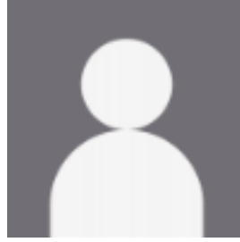
Prestige Property Group Property Management 0295977372