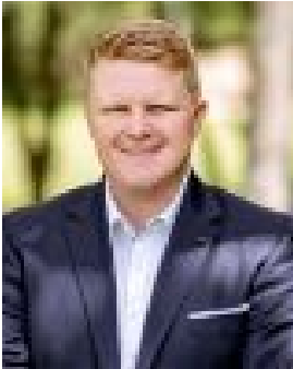
Alexander Garden 0407245287