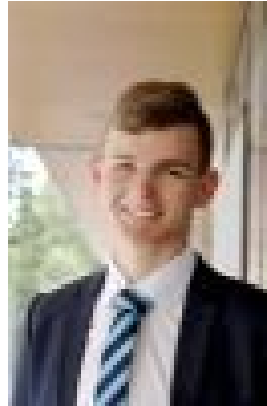
Fin JTS Realty 0472682532