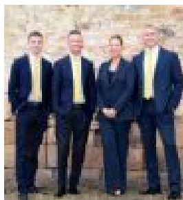
The Norgate Team 0438740496