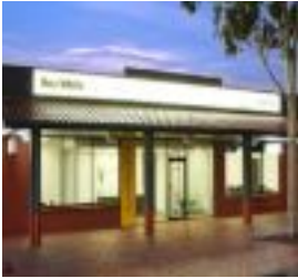
Mill Park Office