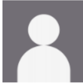
Prestige Property Group Property Management 0295977372