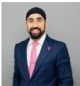
Taraan admin 0390130160