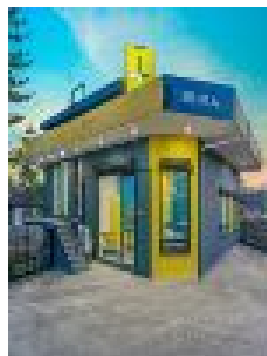
Sales Team 02 9678 1666