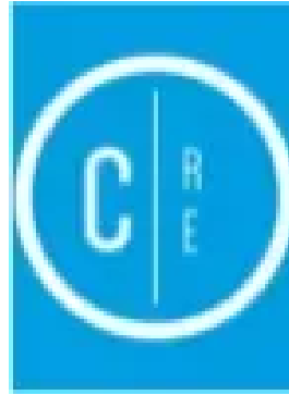
Rental Team 0358254200