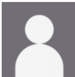
Coastal Robina Admin 0755266999