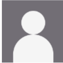
Admin Admin 08 8522 2233