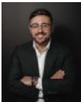
Cristian Malgioglio 0290710306