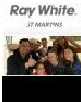
St Martins Rental Team 02 8678 6554