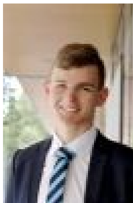
Fin JTS Realty 0265415331