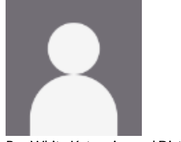
Ray White Katanning and Districts