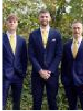
The Padjen Group 0422761463