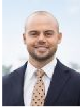
Marc Warren 0295293633