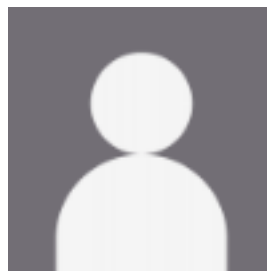
Kashmir Knights 0400289409