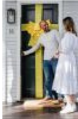
The Coco Team 0423284888