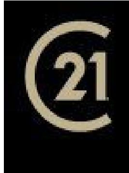
Leasing Team 0291910303