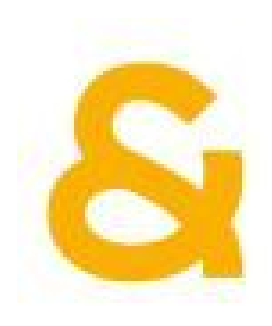
Raine & Horne Wagga Wagga