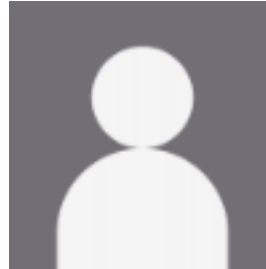
Coastal Robina Admin 0755266999