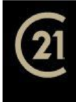
Leasing Team 0291910303