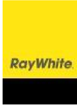
Ray White Canley Heights 0297279088