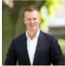
Josh Hart 0363357400