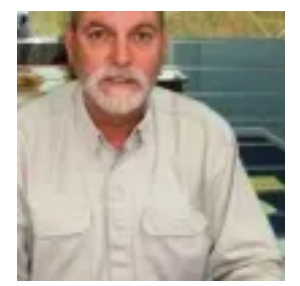
Peter Calliss Calliss

Bedrooms: 3 Bathrooms: 2 Parkings: 2 Type: House