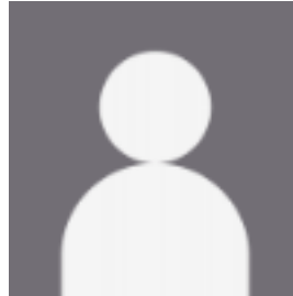
Urban Real Estate Illawarra Team 0438764617