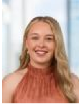
Paris Wall 0474364557