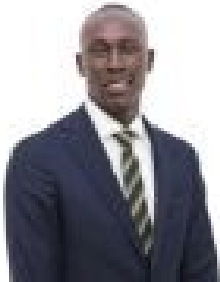
Alor Alor 0479091054