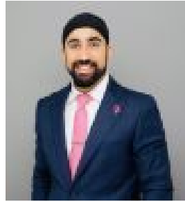
Taraan admin 0390130160