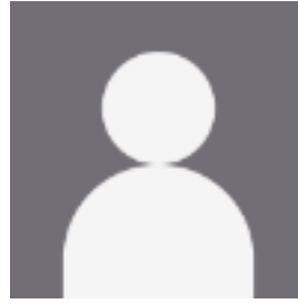
Cascade Property Group