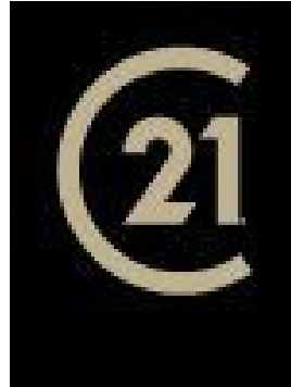
Leasing Team 0291910303